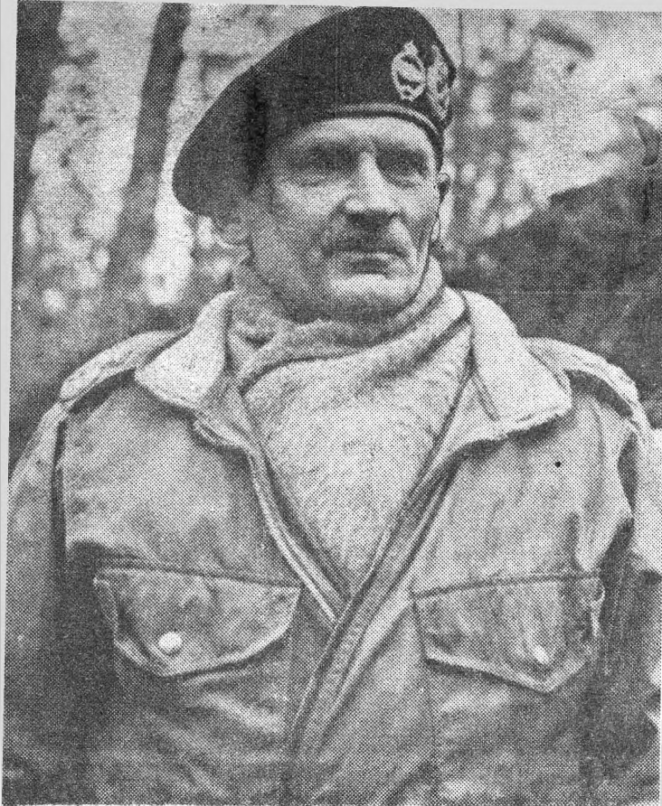
THIS SPLENDID PICTURE of Field Marshal Sir Bernard Montgomery was taken in the field by a Canadian army photographer when the scourge of Nazis visited Canadians to hold the first investiture of the war on German soil