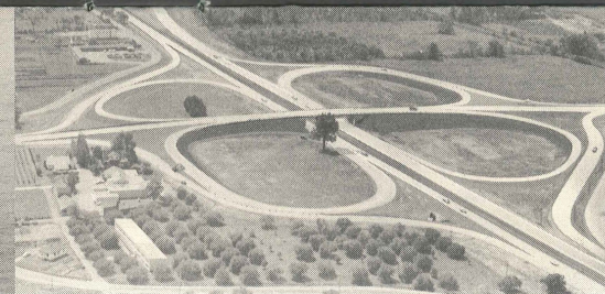
The Queen Elizabeth Highway is the busiest truck transportation route in Canada. This new cloverleaf at Burlington is typical evidence of the dynamic growth of the region.

Burlington is literally at the crossroads of Canada's network of rail, road and water transportation. It is, moreover, strategically located for access to the United States: Your markets and your sources of raw materials will be quickly reached by the highways, railway lines and steamship routes that touch Burlington.